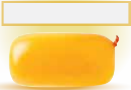
Traditional Mammogram: Flat and Uncomfortable