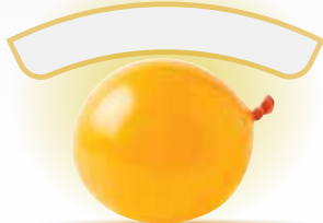
SmartCurve: Curved for Improved Comfort

The curved design of SmartCurve distributes pressure more evenly over the breast to reduce pinching. It has been shown to improve comfort in 93% of patients who reported moderate to severe discomfort with standard compression methods.